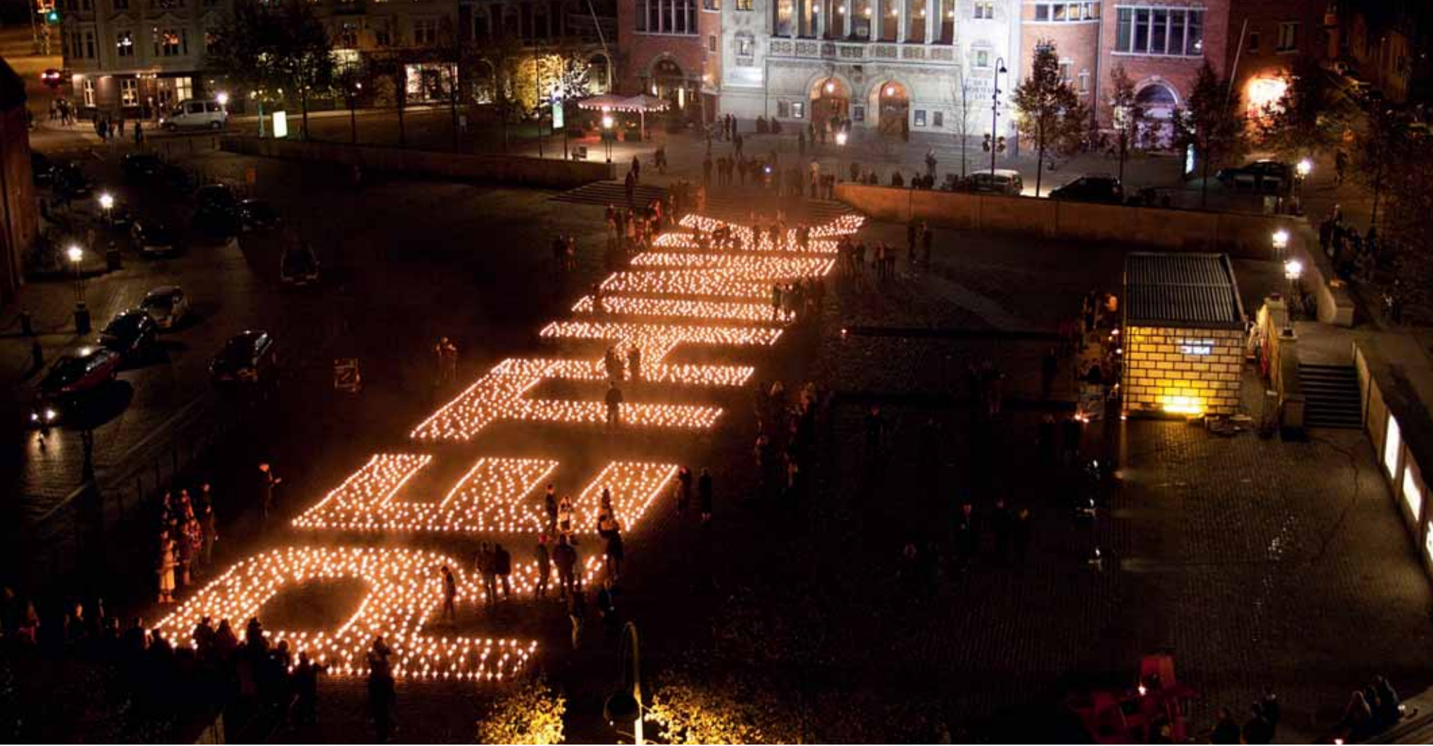
Aarhus 2017 — Rethink landscape

summer carnivals. ‘Neighbourhood weeks’ constituted themselves as an association and have continued to arrange the weeks every year. An accessibility project has been managed by the Arts Academy at Turku University of Applied Sciences, and now accessibility activities and education are strongly embedded in its syllabus.