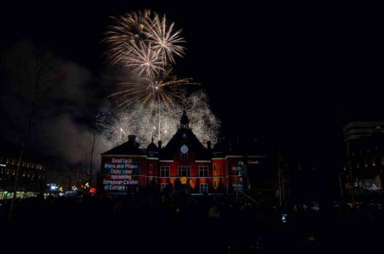
Umeå 2014 — Closing ceremony, Northern light