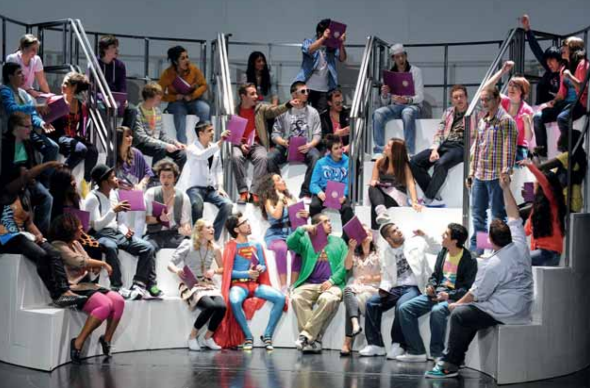
Essen for the Ruhr 2010 — TWINS project, Next Generation