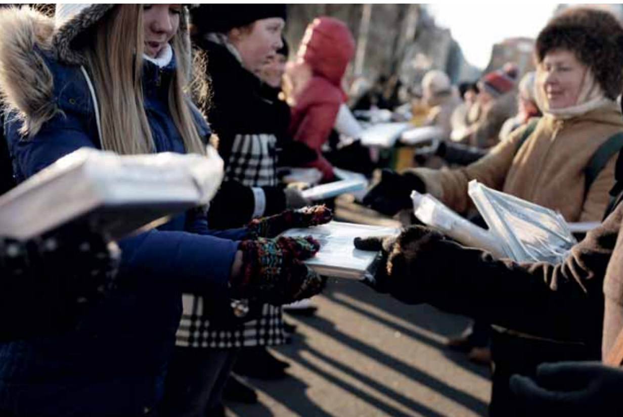
Riga 2014 — Chain of book lovers

During its evolution, the programme has encouraged a stronger commitment towards more closely-defined and locally-sensitive vision statements. It is important that the programmes not only correspond to the ambitions of the planners but also sit comfortably with the city's own population. This requires an acute consciousness of local culture — in every sense of the word — to ensure that the content of the programme and the creation or import of new cultural activities win the support of local communities, rather than generate disruption and associated tensions.