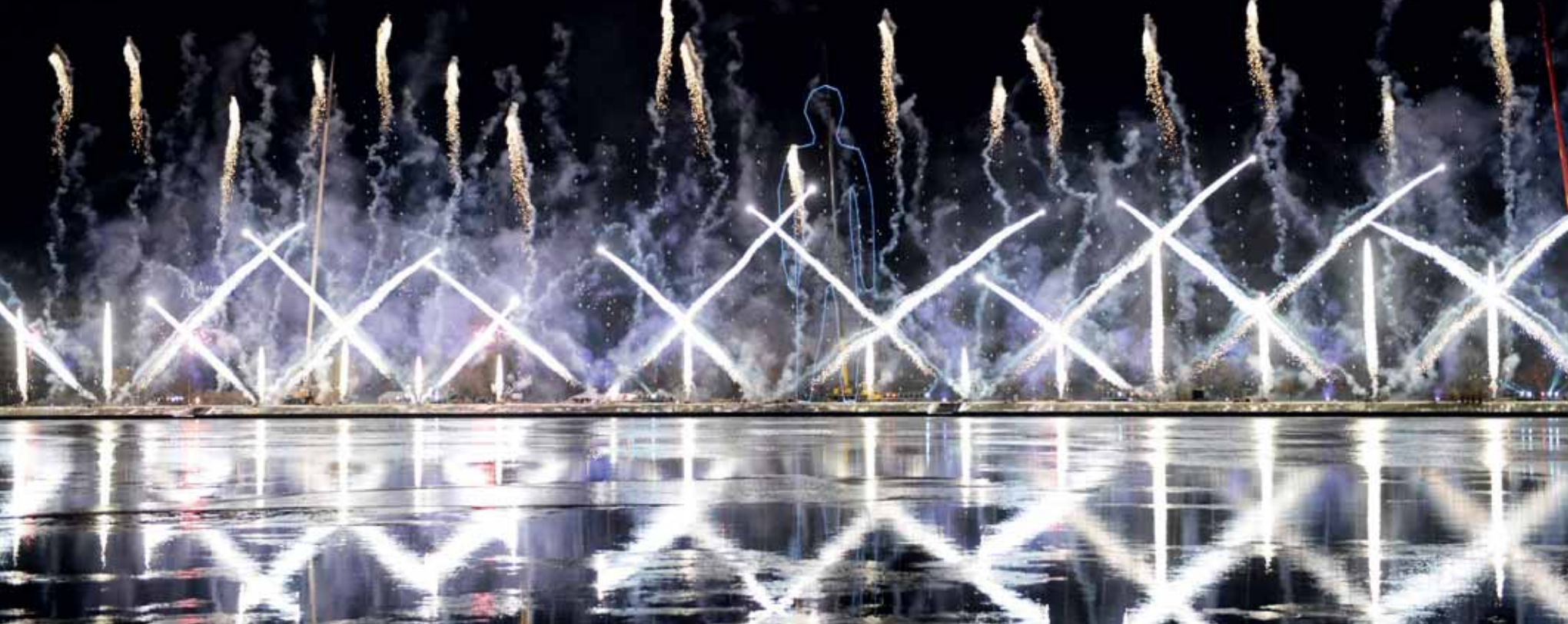
Riga 2014 — Musical light show

based on a pre-existing geographical, historical or more personal links. The European dimension can also be explored through developing European themes and issues or celebrating aspects of European history, identity, shared values and heritage. Sometimes this has taken the form of presenting old themes in fresh ways, or revealing hidden aspects of a European connection — or even tackling difficult themes that resonate across the continent. Specific partnerships between cities have also offered scope for new reflections and new relations.