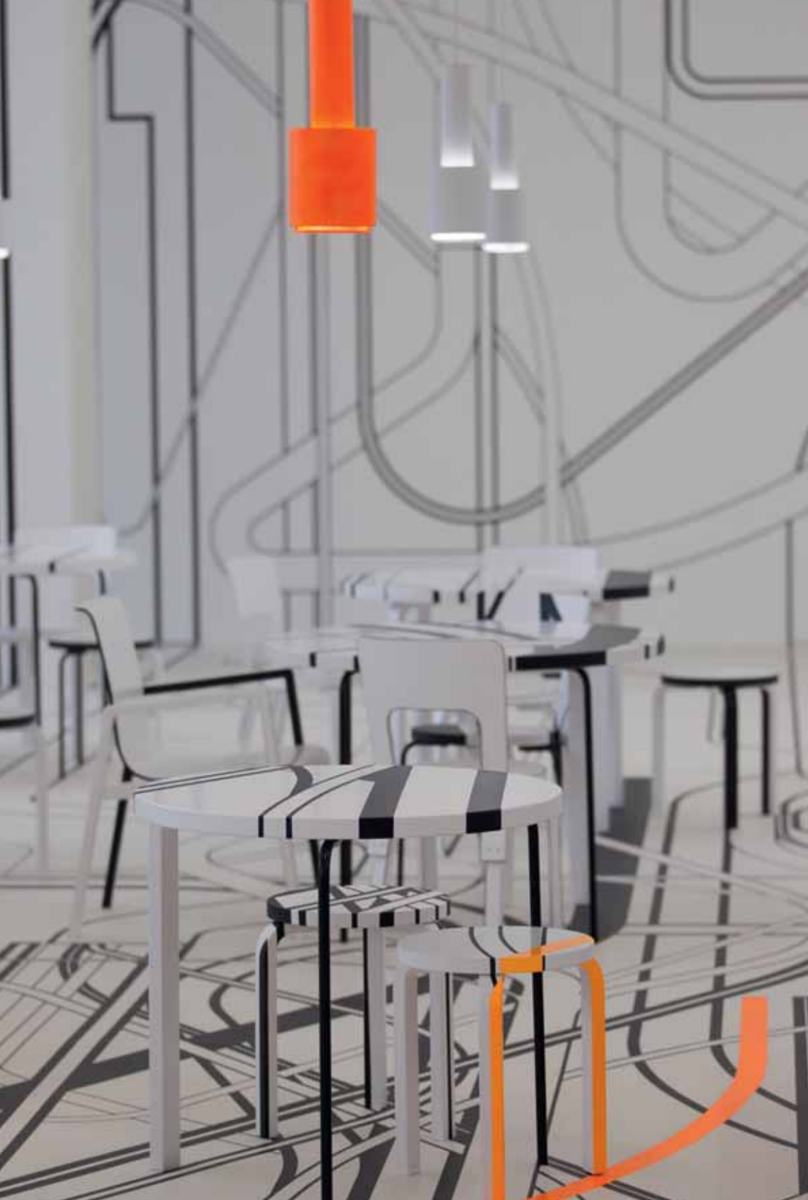
Turku 2011 — Logomo Café 'Nothing happens for a reason' by Tobias Rehberger

European Capital of Culture year was an element — and the culmination — of a long-term engagement for the cultural and creative economy. As a result, this sector now represents some 86 000 employees in more than 10 000 businesses across the Ruhr area — linking culture, urban development and education. The centre, jointly run and funded by local and regional authorities, also with a contribution from the EU Structural Funds, is committed to supporting its components as well as the development of creative locations and spaces.