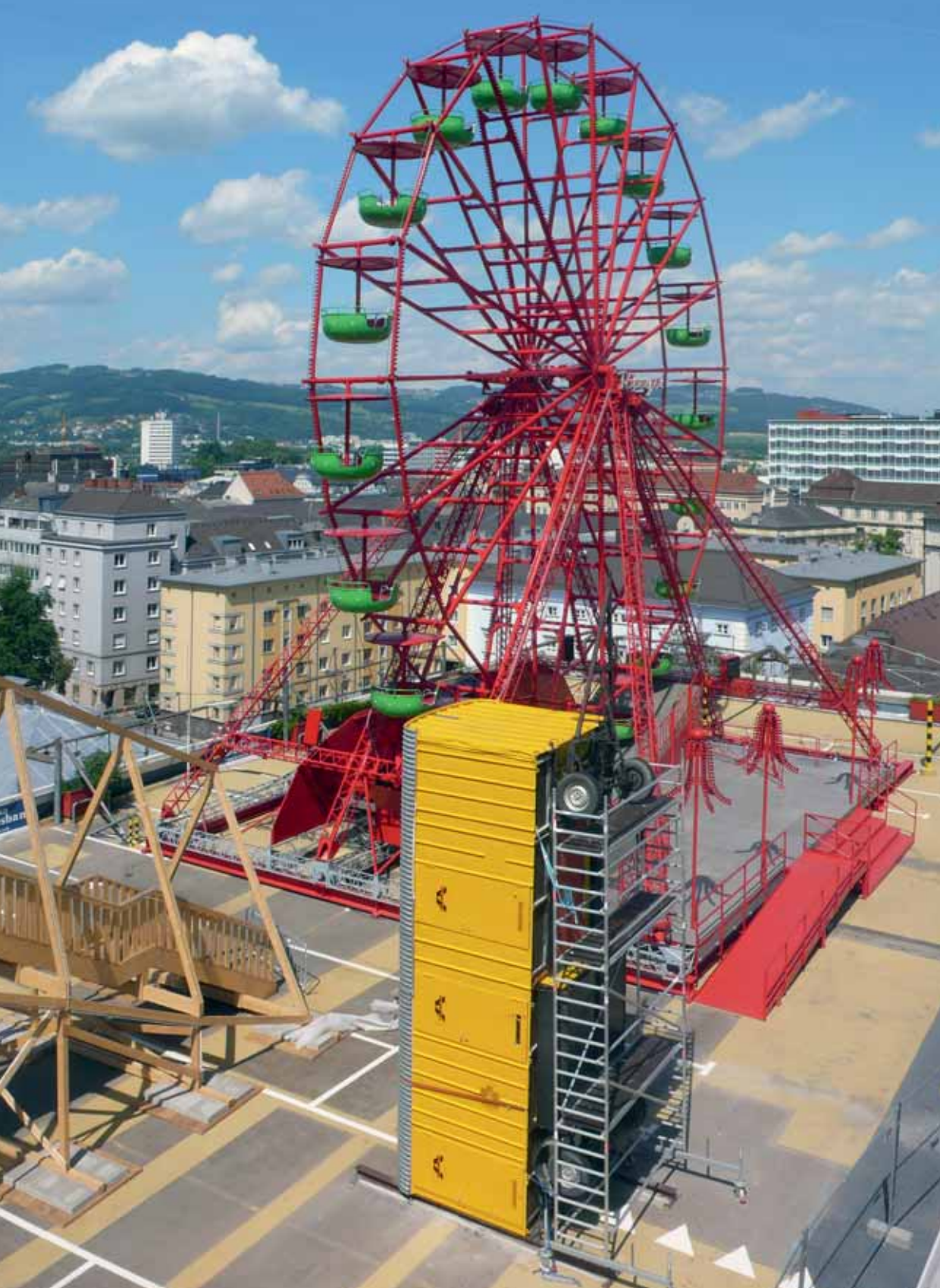
Linz 2009 — Höhenrausch — photographer: Andreas Strauss